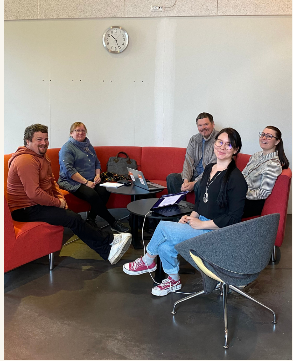
Participants working hard on creating good project ideas for the future

The participants also got to try some practical tasks, such as creating project proposals and to pitch it in front of the rest of the participants. There were many great project ideas floating around, and we hope to see them realised in the future!